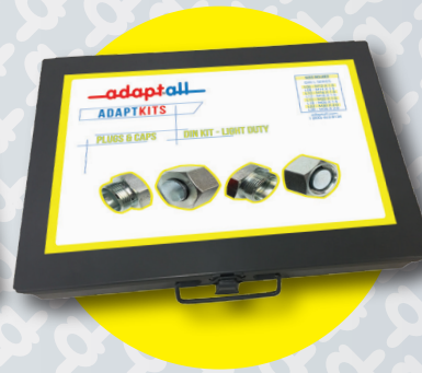
PLUGS & CAPS DIN - LIGHT DUTY