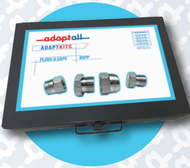
PLUGS & CAPS BSSP