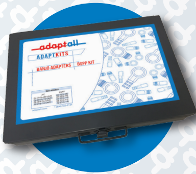
BANJO ADAPTERS BSSP

Adaptall's compact and durable metal kits take up very little space in a distributors warehouse or store and come with the most popular sizes included. Distributors can sell the parts individually or sell as an invaluable kit for all mobile and installation applications. Drawer systems are also available for purchase!