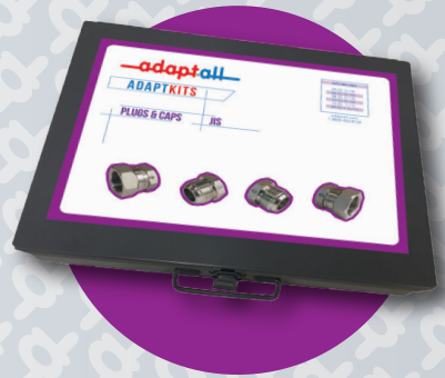
PLUGS & CAPS JIS