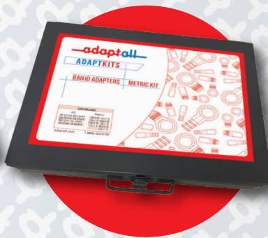
BANJO ADAPTERS METRIC