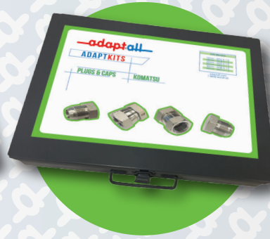
PLUGS & CAPS KOMATSU