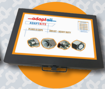
PLUGS & CAPS DIN - HEAVY DUTY