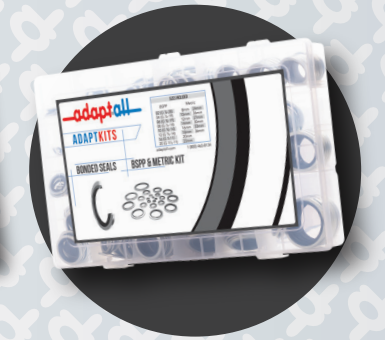
BONDED SEALS BSSP & METRIC